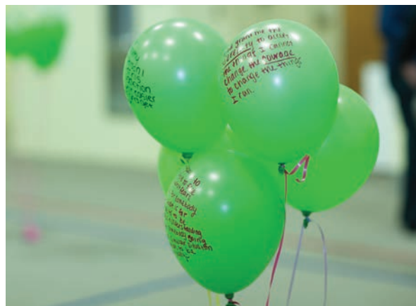
Balloon launch in recognition of Children's Mental Health Awareness Day