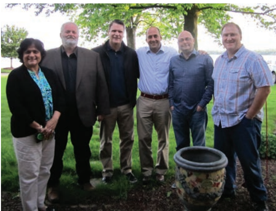
Faculty of the 2015 Pediatric BTTI

Rogers Memorial Hospital–Kenosha expands services by adding a dual diagnosis intensive outpatient program for adults.